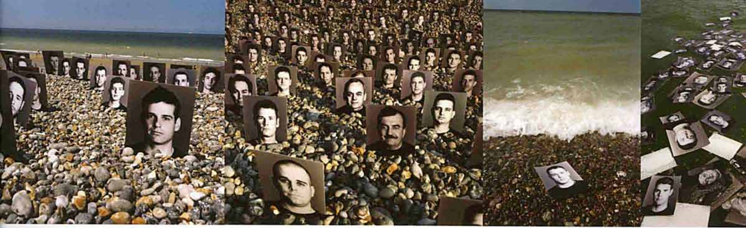
Jubilee (Dieppe) installation views 2002